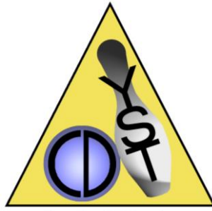
Capital District Youth Scholarship Tour