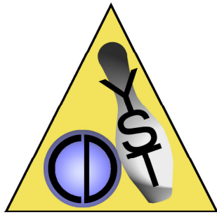
Capital District Youth Scholarship Tour