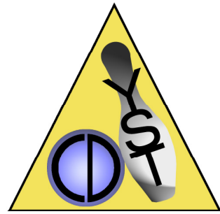
Capital District Youth Scholarship Tour